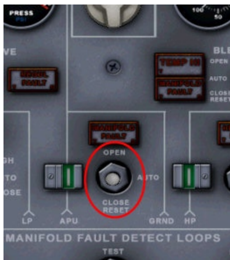
Figure 9: APU bleed switch in „AUTO“