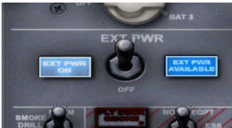
Figure 5: External power switch