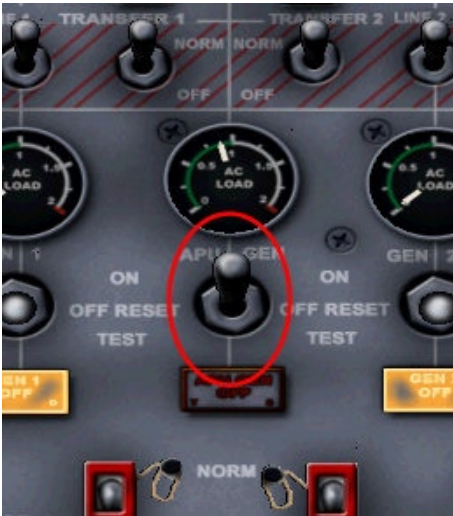
Figure 8: Connect the APU generator