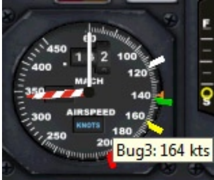
Figure 12: Click and drag speedbugs

You can also manually drag the speed bugs to the desired position. To do so, left click on the location of the speed bug you want to drag and move the bug while pressing down the left mouse button.