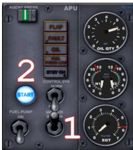
Figure 7: APU start sequence