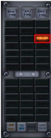
Figure 18: Click zone to turn off THR OFF warning

Note: The Master warning panel includes a hidden click zone to turn off the THR OFF warning lights.