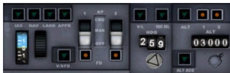
Figure 15: Automatic flight control system

Finally a word on the autoflight system. This system is somewhat different from the standard Boeing and Airbus autopilots that you are probably used to.