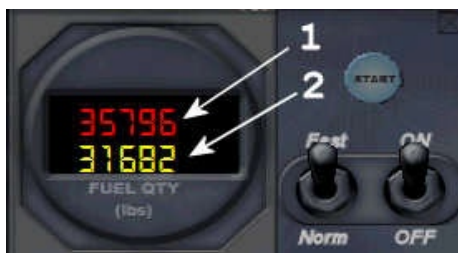
Figure 2: Fuel-loader

Power up the re/de-fuel gauge with the ON/OFF switch.