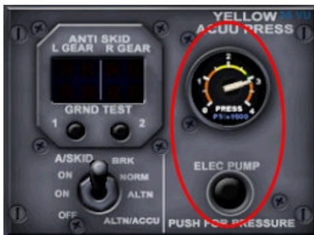
Figure 13: Yellow accu pressure indicator and button

The parking brakes in the A300B4-200 are fed by a subsystem of the YELLOW hydraulic system. The yellow system is pressurized by the right engine (engine number 2) and a minimum pressure is required before the parking brakes will work. Of course it wouldn't make sense if you had to start the engines before the parking brakes could be set, therefore an AC driven electrical pump was installed to pressurize the brake accumulator (the same system is used in many aircraft like the Bae146).