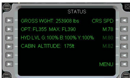
Figure 14: Set-up panel „Status“ page

The “Status” page of the set-up panel shows the optimum and maximum cruising level for the current gross weight and selected Mach cruising speed.