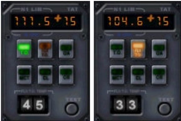
Figure 17: N1 Computer with TO and FLX TO mode selected

On the ground only N1 A/T mode is available, once airborne both N1 and Speed mode are available.