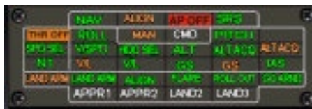
Figure 16: FPI

The A300 has 2 autopilots (AP) and two flight directors (FD's). In fact the FD's are the primary instruments that provide information to the autopilots. The active autopilot mode can only be read from the failure and performance indicator (FPI).