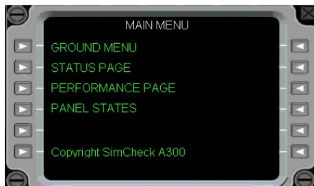
Figure 3: Set-up main menu