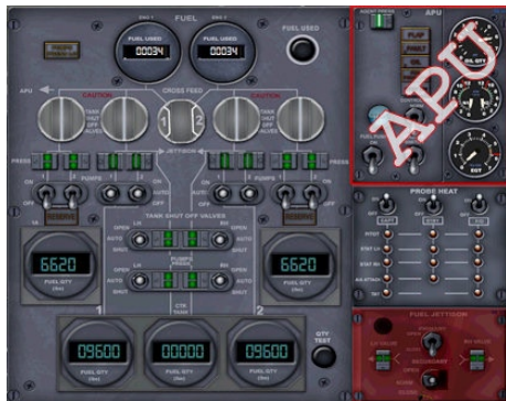
Figure 6: APU section on fuel panel